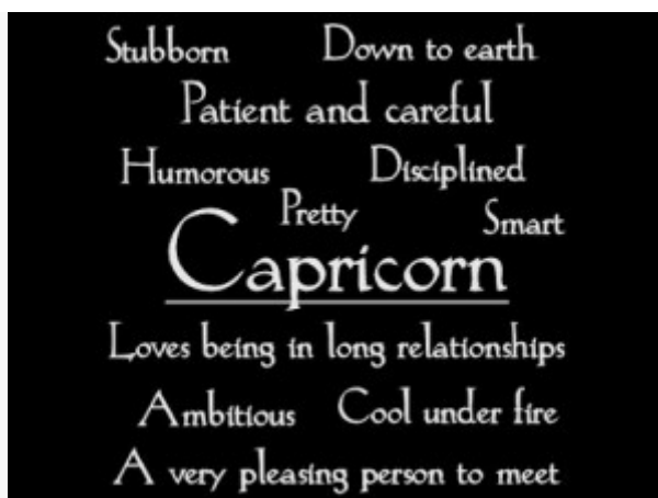
Sign of the Zodiac

Another test was ready to label its curious victim as a lion, golden retriever, otter, or other mammal.